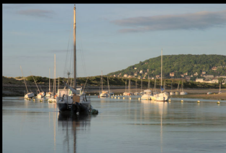
Subtle – Improved detail in shadows