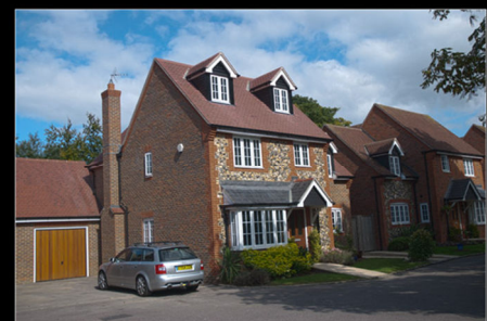
Clean – Flatter image for simpler image?