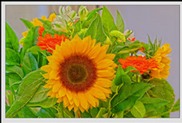
Too much? – what was the photographer thinking?

It became a “fashion” to overdo the effect at the Tone Mapping stage and create pictures with lurid colours and dramatic contrast. This, I believe, has given HDR a bad reputation that it doesn’t necessarily deserve. It’s all a matter of taste; HDR is an inherently useful tool, but allowing people into the equation will always produce unpredictable results!